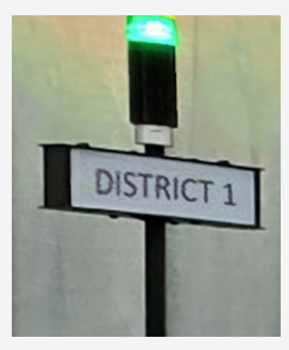
STATUS LIGHT SIGN

Maximize your Situational Awareness Light benefits with these optional accessories.